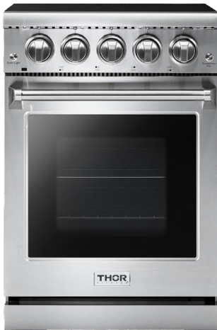
Product: 24 Inch Professional Electric Range in Stainless Steel Model Number: HRE2401