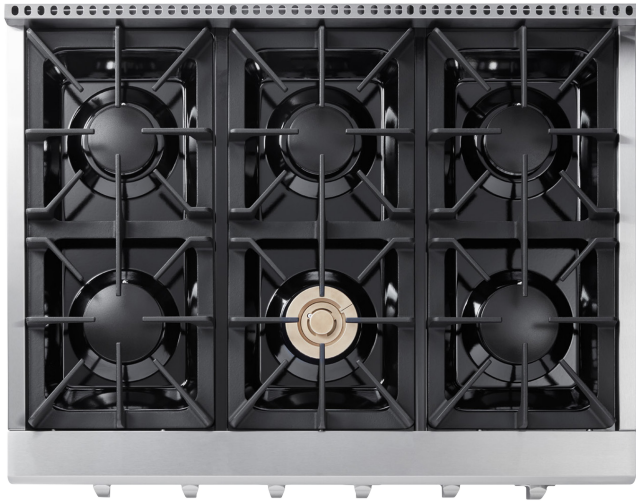
Product: 36 Inch Gas Rangetop Model Number: HRT3618U / HRT3618ULP